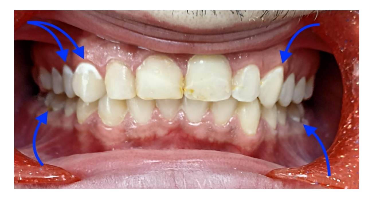
Figure 2. The clinical image of a 22-year-old male patient who consumes energy drinks at least twice a day (660 ml).

Initially, the erosion may affect only the enamel, which appears matte, while the abraded enamel has a shiny surface. As the lesion progresses into the dentin, various colors ranging from yellow to brown can be observed, and the tooth becomes sensitive to temperature changes. In the early stages, the shallow lesions exhibit a white or light yellow appearance, indicative of exposed dentin. Later, the lesions become round-edged, wide, irregular, and discolored. Consequently, the affected dentin displays a dark yellow and brownish appearance, which does not change with a physical manipulation [68] (Figure 3).