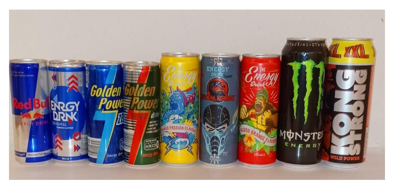
Figure 1. Some energy drinks sold on market shelves under different brand names

Energy drinks are beverages that contain sugar, caffeine, and other stimulating ingredients (taurine, ginseng, ginkgo biloba, B vitamins) to improve mental and physical performance, concentration, and endurance. They have been first started to be produced in Austria as a response to consumer demand for meeting increased personal energy requirements [1]. The demand for energy drinks have been increased day by day. these drinks have taken their place on market shelves where people can easily reach them under different brand names. [1] (Figure 1).