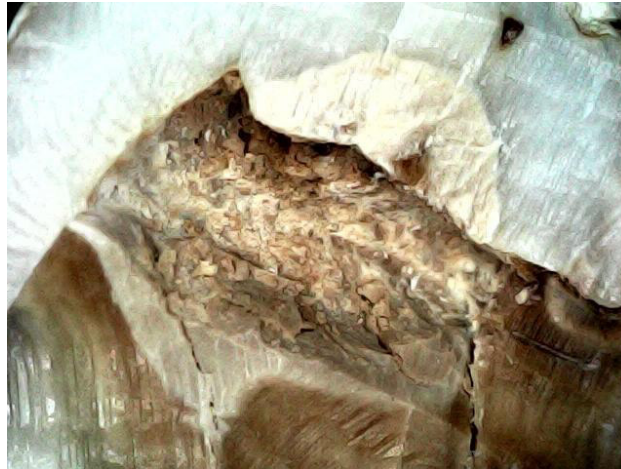
Figure 1. Magnified image of the dental structure of a human molar, showing a deep carious lesion in the dentin. Darkened, disorganized, and friable dentin tissue can be observed, consistent with infected dentin colonized by microorganisms. The discontinuity of the enamel and dentin exposure indicate caries progression beyond the dentinoenamel junction. The image illustrates the distinction between infected dentin, which must be removed, and affected dentin, which may be remineralizable — a fundamental concept in the conservative clinical management of caries (Santos et al. , 2014).

and progresses with microbial invasion of the dentin, compromising the dentinal structure and tubules, as illustrated in Figure 1.