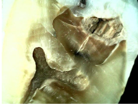
Figure 2: Magnified image of a lower molar with a deep carious lesion, showing extensive dentin destruction and invasion of the pulp chamber. A darkened coloration and tissue disorganization are observed, suggestive of advanced dentin necrosis. The lesion's progression to the pulpal floor indicates pulp exposure and risk of periapical infection, illustrating the typical course of untreated caries (Santos et al. , 2014).

Upon reaching the pulp, the initial response of the pulp tissue is acute inflammation, mediated by innate immune mechanisms, with the release of inflammatory cytokines and recruitment of defense cells (Fejerskov et al. , 2017). If the aggression persists, the pulp tissue loses its defense capacity, progressing to irreversible pulpitis and subsequently to pulp necrosis (Lima, 2007).