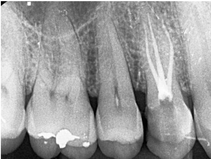
Figure 2 - Root canal filling was performed using the single cone technique.

Three canals were prepared using Sequence Niti rotary instruments (MK Life) to #25.06, and the root canals were irrigated with 2,5% sodium hypochlorite solution. Root canal filling was performed using the single cone technique associated with Bio-C Sealer cement and 25.06 taper gutta-percha tip were used. The postoperative X-ray showed that all the 3 canals were filled (Figure 2).