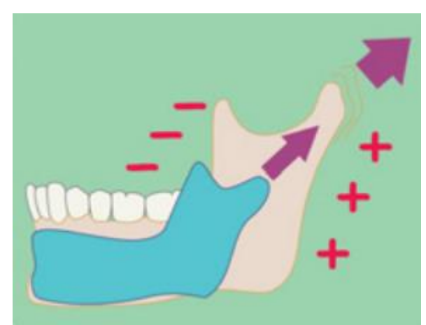
FIGURE 2: Posterior superior growth of the condyle and posterior branch growth [4].

The length of the mandible increases almost exclusively due to postero-superior growth of the condyle and posterior growth of the branch, as shown in Figure 2.